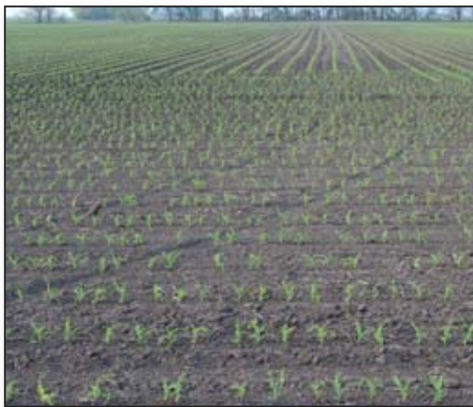
Seedling stage corn in the 1 to 4-leaf stage remains susceptible to cutting by black cutworms (Champaign County, April 4).